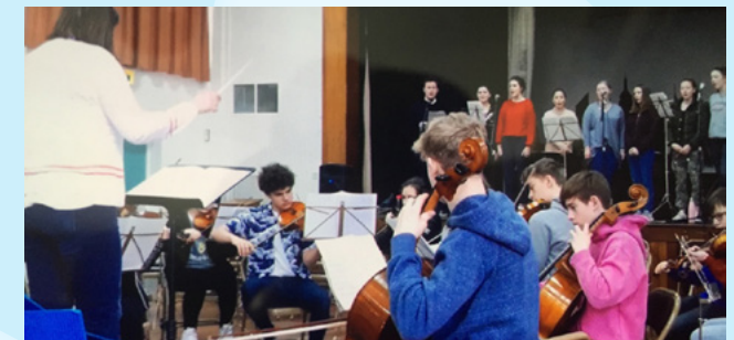
Senior Strings rehearsing an arrangement of Coldplay's 'Viva la Vida' with the Senior Choir.

Unfortunately, we were unable to perform our two Easter Concerts on the 21 and 28 March. Staff have kept positive aiming for concerts on Sat 4th July and would either use the Easter music or new. However, if we are not able to meet before the summer then we will aim to celebrate our return as well as trying to acknowledge our eleven Year 13 students for their long service.