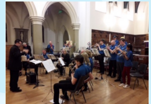
Mid-Year Concert at Christ Church Skipton