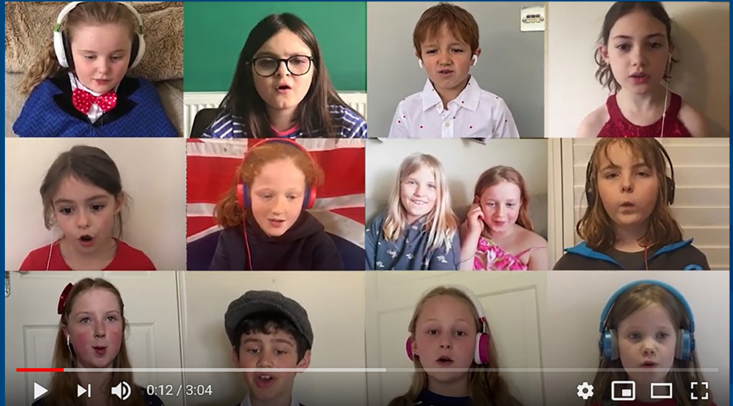
Pictured above: 250 pupils from schools across the county performing the VE day concert

There are great opportunities to be part of the Hub and this edition contains information about how and when you can get involved in music making across the county.